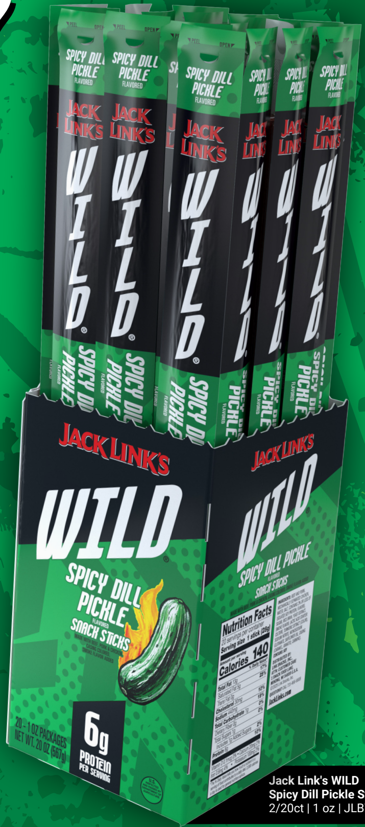
Jack Link's WILD Spicy Dill Pickle Stick 2/20ct | 1 oz | JLB79792

WILD SPICY DILL PICKLE STICKS COMBINE SPICY HEAT AND ZESTY PICKLE FLAVOR FOR A BOLD NEW WAY TO SNACK.