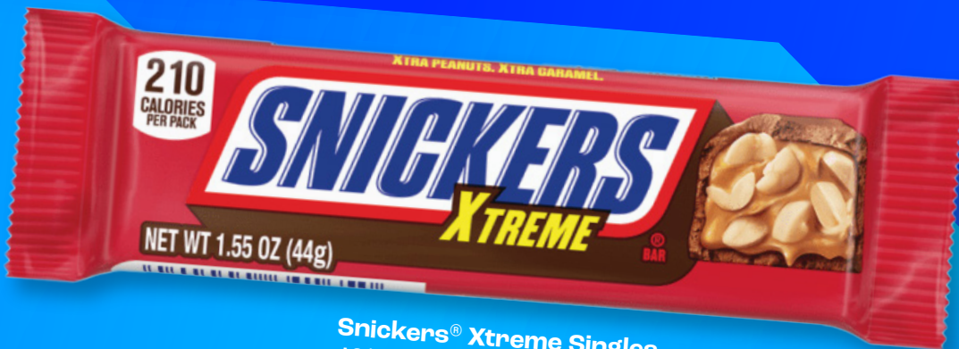
Snickers® Xtreme Singles 12/24 pk | 1.55 oz | MMM64108

Exclusions may apply. This item may not be available in all regions. Offerings, quantities, and participation may vary by location. Please contact your local Vistar representative for specific details, availability, and terms.