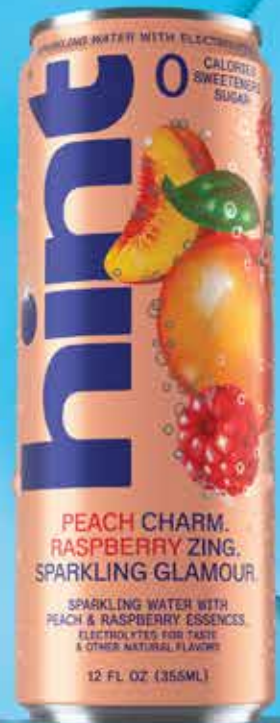
SPARKLING PEACH RASPBERRY 12OZ CAN: HNT02193