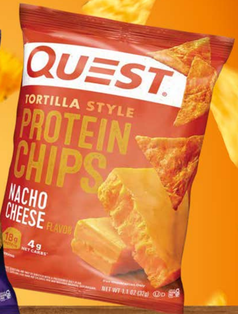
Quest Nacho Protein Tortilla Chip 8 pk | 1.1 oz | QUN01029

Exclusions may apply. This item may not be available in all regions. Offerings, quantities, and participation may vary by location. Please contact your local Vistar representative for specific details, availability, and terms.