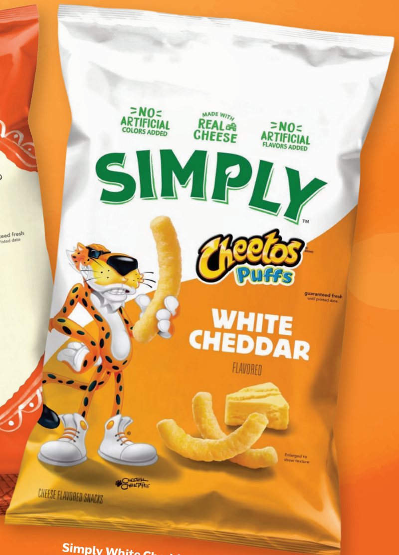
Simply White Cheddar Cheese Puffs 64pk | 1.25 oz | FRI05819

Exclusions may apply. This item may not be available in all regions. Offerings, quantities, and participation may vary by location. Please contact your local Vistar representative for specific details, availability, and terms.