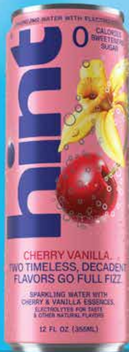
SPARKLING CHERRY VANILLA 12OZ CAN: HNT02246