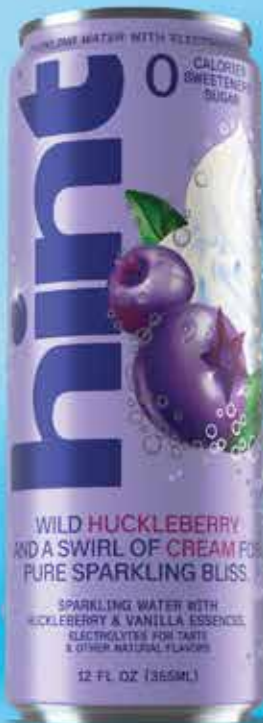
SPARKLING HUCKLEBERRY CREAM 12OZ CAN: HNT02242