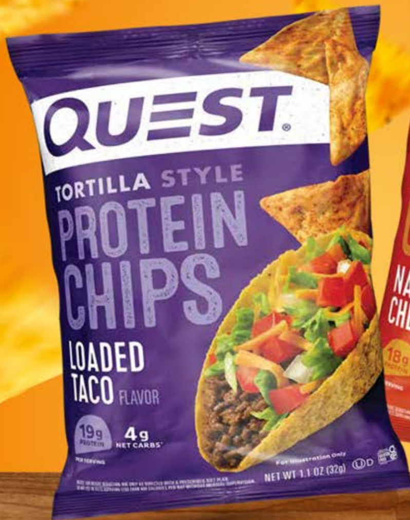
Quest Loaded Taco Protein Tortilla Chip 8 pk | 1.1 oz | QUN01027

Fuel customer demand with high protein options that support sustained energy, strong velocity, and incremental sales across multiple occasions.