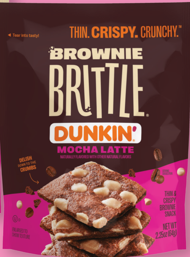
Brownie Brittle Dunkin Mocha Latte 8 Pack | 2.25 oz | SGB01350

Exclusions may apply. This item may not be available in all regions. Offerings, quantities, and participation may vary by location. Please contact your local Vistar representative for specific details, availability, and terms.