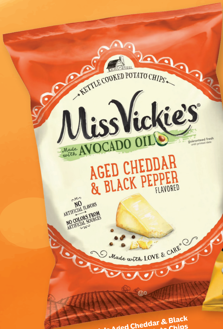
Miss Vickie's Aged Cheddar & Black Pepper Kettle Cooked Potato Chips 24pk | 1.62 oz | FRI79684