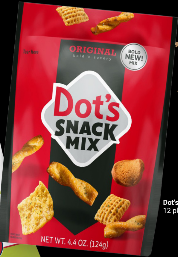
Dot's Pretzels 12 pk | 2.5 oz | DDP00812

PLEASE CONTACT YOUR VISTAR REPRESENTATIVE TO ORDER TODAY.