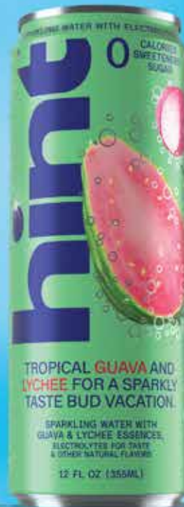
SPARKLING GUAVA LYCHEE 12OZ CAN: HNT02244