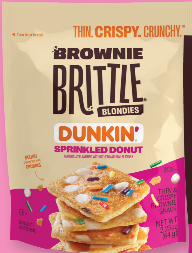
Brownie Brittle Dunkin Sprinkled Donut 8 Pack | 2.25 oz | SGB01340

Sprinkled Donut and Mocha Latte flavors bring Dunkin' coffeehouse inspiration to the crispy crunch of Brownie Brittle.