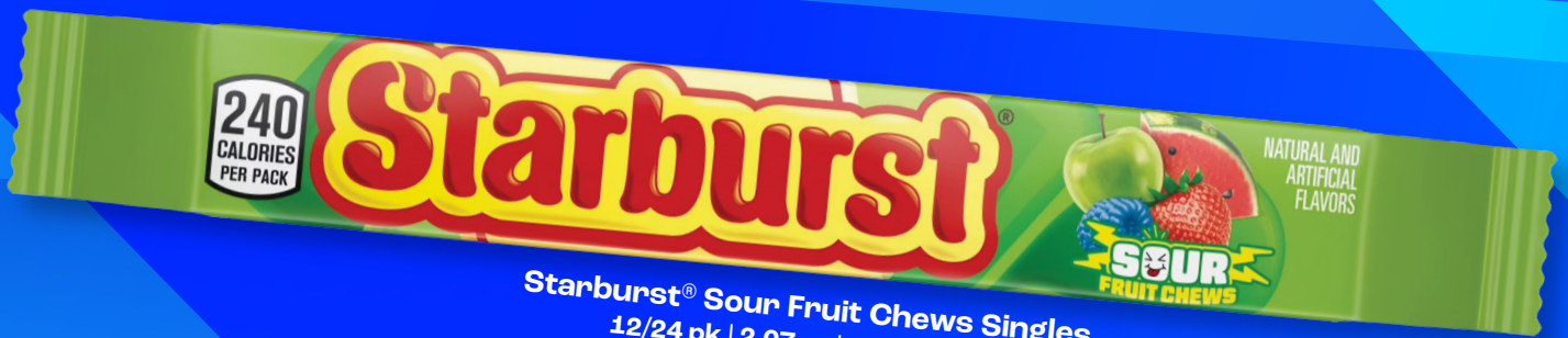
Starburst® Sour Fruit Chews Singles 12/24 pk | 2.07 oz | MMM33011

With Starburst® Sour Fruit Chews and Snickers® Xtreme, these new offerings add excitement and variety to the candy lineup customers already love.