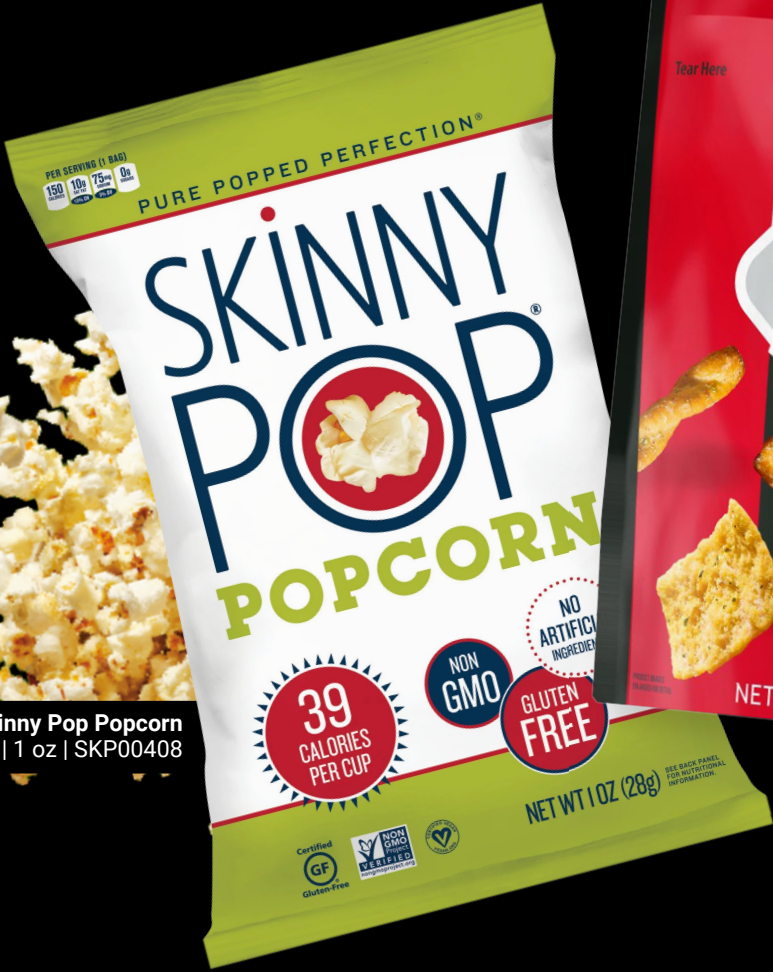
Skinny Pop Popcorn 12 pk | 1 oz | SKP00408

SkinnyPop Popcorn and Dot's Pretzels bring two well-known snack brands that help round out any grab-and-go snack selection.