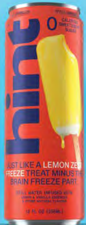
LEMON ZEST FREEZE 12OZ STILL CAN: HNT02236