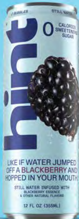
BLACKBERRY 12OZ STILL CAN: HNT02227