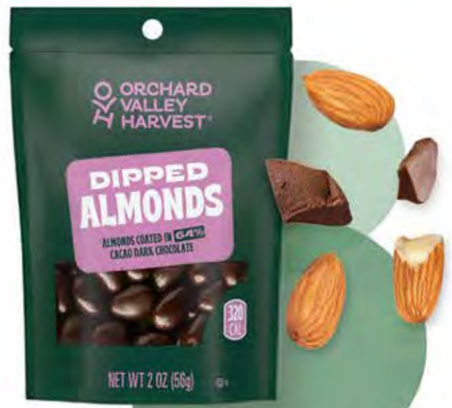
JOH13662 • 30/2oz