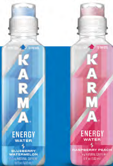
BLUEBERRY WATERMELON KAC00880