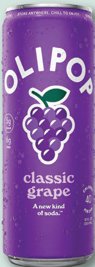
Ollipop Classic Grape 12 pk | 12 oz | IC063912

66% of Consumers Seek Better-for-You Options