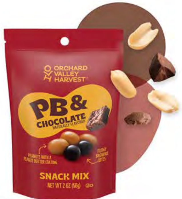
JOH14201 • 14/2oz