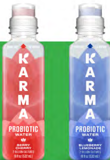
BERRY CHERRY KAC00368