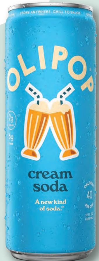
Ollipop Cream Soda 12 pk | 12 oz | IC063910