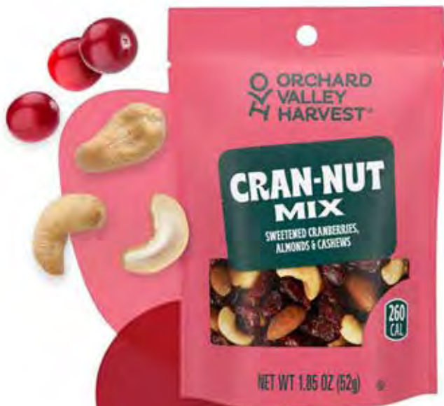
JOH13661 • 30/1.85oz