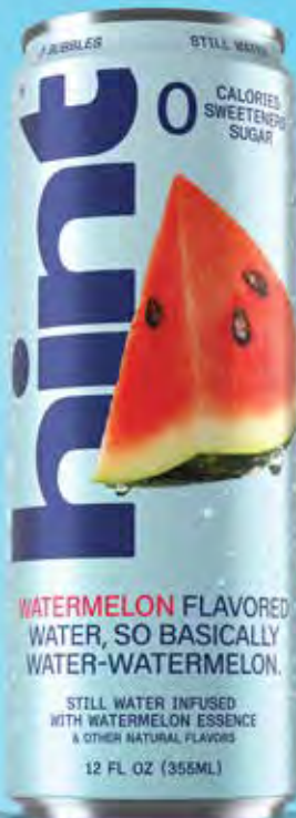
WATERMELON 12OZ STILL CAN: HNT02226