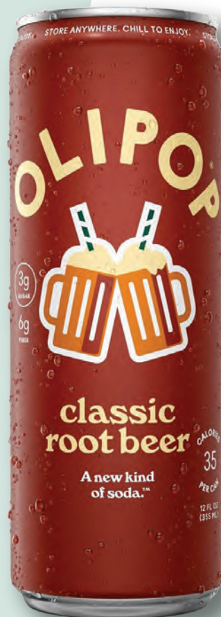
Ollipop Classic Root Beer 12 pk | 12 oz | IC063911