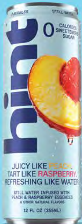
PEACH RASPBERRY 12OZ STILL CAN: HNT02229