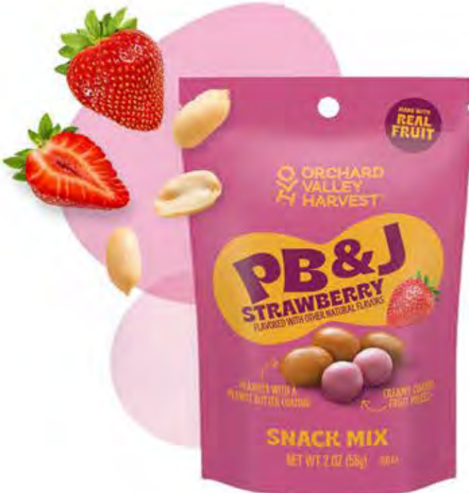
JOH14200 • 14/2oz