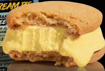
BANANA! SCREAM PIE