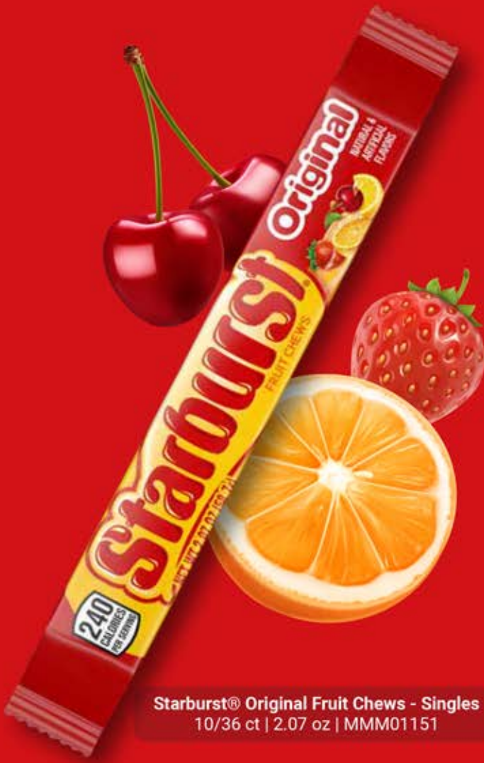
Starburst® Original Fruit Chews - Singles 10/36 ct | 2.07 oz | MMM01151

Stock both fan-favorite varieties to satisfy more consumers and bring added variety to your candy assortment.