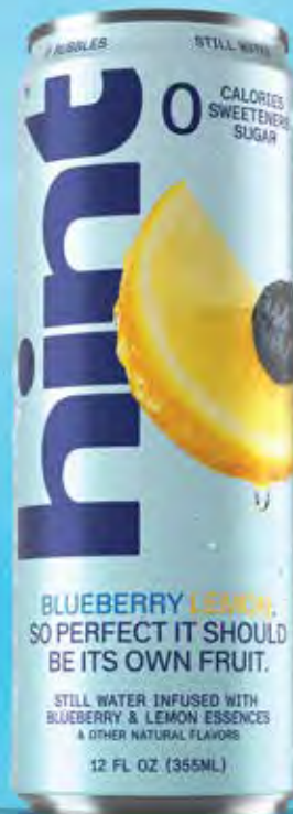
BLUEBERRY LEMON 12OZ STILL CAN: HNT02228