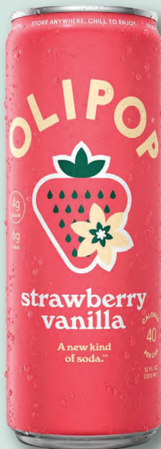
Ollipop Strawberry Vanilla 12 pk | 12 oz | IC063909