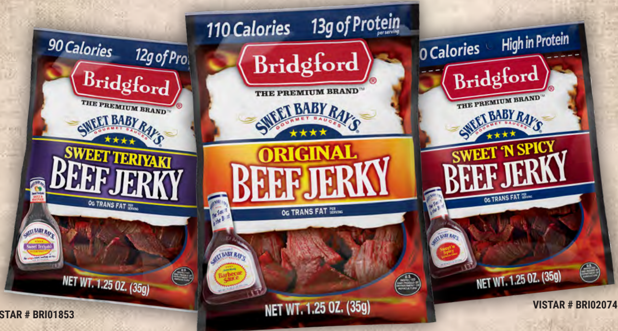
VISTAR # BRI01853