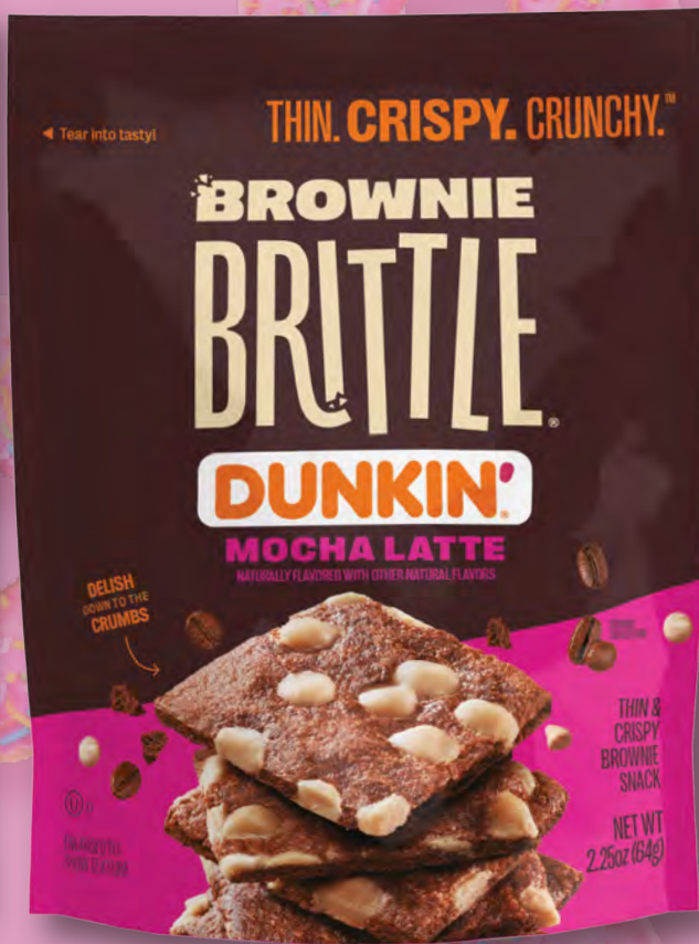
Brownie Brittle Dunkin Mocha Latte 8pk | 2.25oz | SGB01350

Exclusions may apply. This item may not be available in all regions. Offerings, quantities, and participation may vary by location. Please contact your local Vistar representative for specific details, availability, and terms.