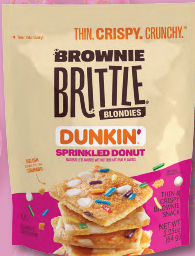
Brownie Brittle Dunkin Sprinkled Donut 8pk | 2.25oz | SGB01340

Dunkin flavors like Sprinkled Donut and Mocha Latte meet the signature crispy, chocolatey crunch of Brownie Brittle.