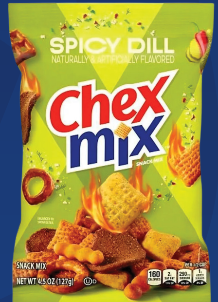
Chex Mix Spicy Dill 8 pk | 4.5 oz | GEM22908

Exclusions may apply. This item may not be available in all regions. Offerings, quantities, and participation may vary by location. Please contact your local Vistar representative for specific details, availability, and terms.