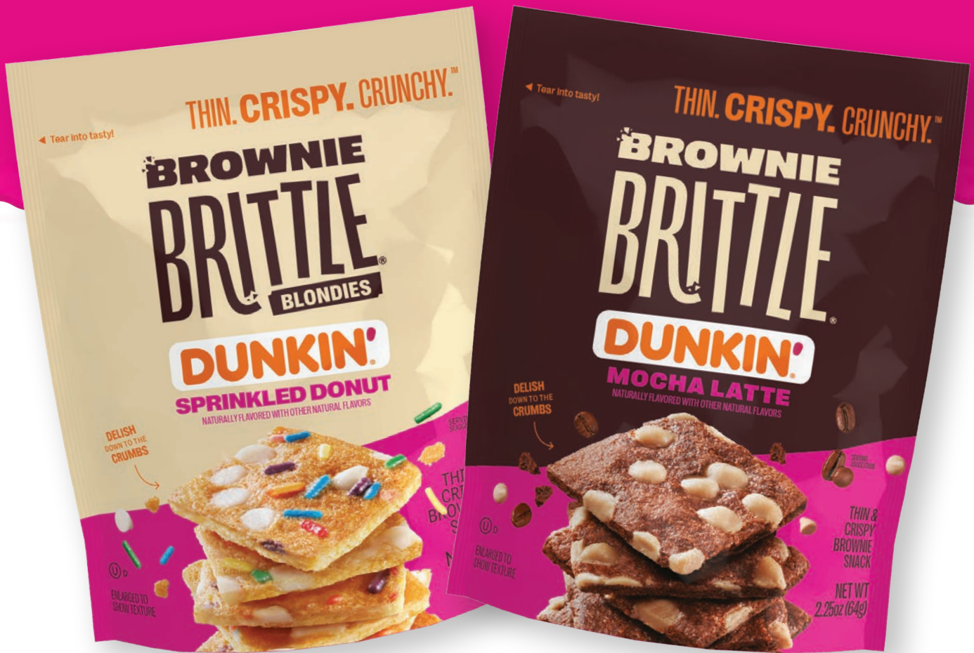
Brownie Brittle Dunkin Sprinkled Donut 8 | 2.25 oz | SGB01340

Brownie Brittle brings Dunkin' inspired innovation to the snack set with Sprinkled Donut and Mocha Latte flavors.