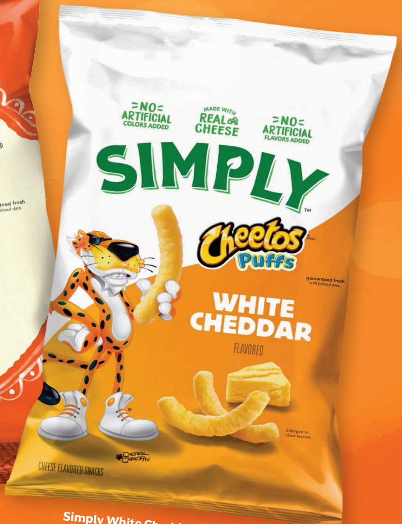
Simply White Cheddar Cheese Puffs 64pk | 1.25 oz | FRI05819

Exclusions may apply. This item may not be available in all regions. Offerings, quantities, and participation may vary by location. Please contact your local Vistar representative for specific details, availability, and terms.