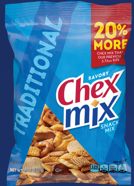
Chex Mix Traditional 8 pk | 3.75 oz | GEM14858 60 pk | 1.75 oz | GEM1240