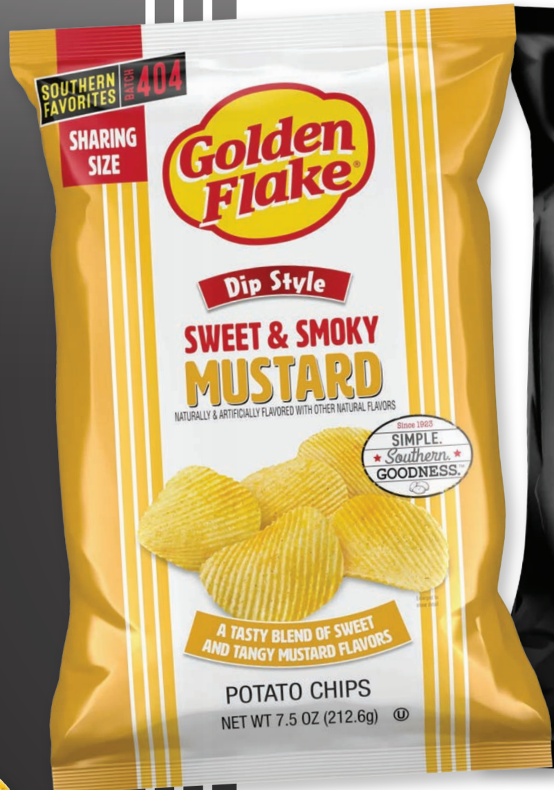
Golden Flake Dip Style Sweet & Smoky Mustard Potato Chips 60 | 1.5 oz | UQF40449

Golden Flake Dip Style chips offer Sweet & Smoky Mustard and Sweet Heat varieties that help create a more dynamic snack assortment.