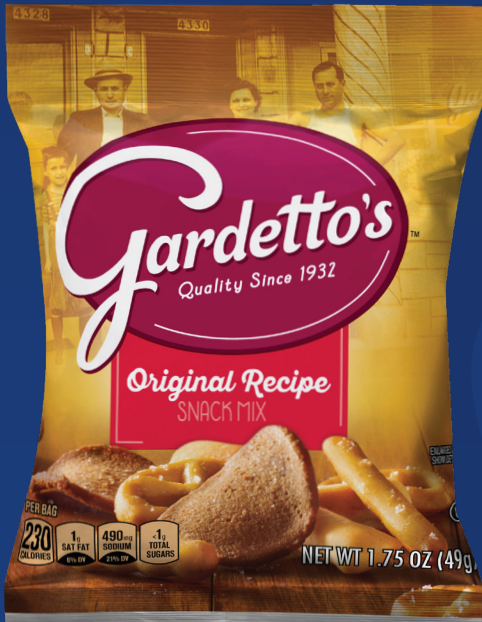
Gardetto's SnackMix Original 36 pk | 2.5 oz | GEM1474 60 pk | 1.75 oz | GAR20026