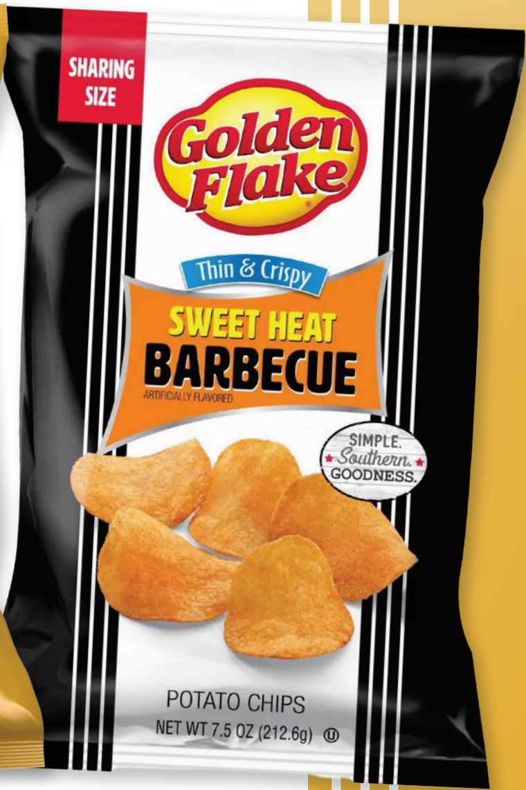
Golden Flake Dip Style Sweet Heat Potato Chips 60 | 1.5 oz | UQF40452

Exclusions may apply. This item may not be available in all regions. Offerings, quantities, and participation may vary by location. Please contact your local Vistar representative for specific details, availability, and terms.