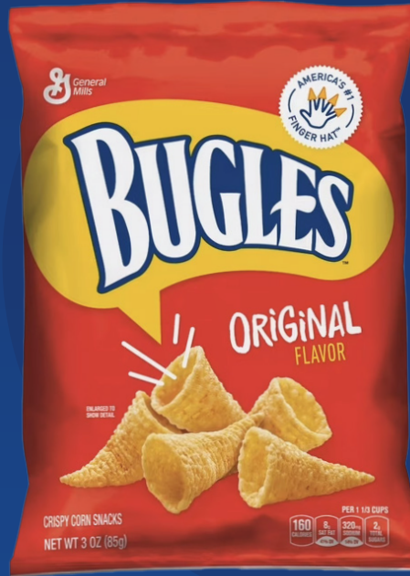
Bugles Original 36 pk | 1.5 oz | GEM3681 6 pk | 3 oz | GEM14834

From Gardetto's and Bugles to Chex Mix favorites, these craveable snack mixes deliver the familiar flavors customers reach for again and again.