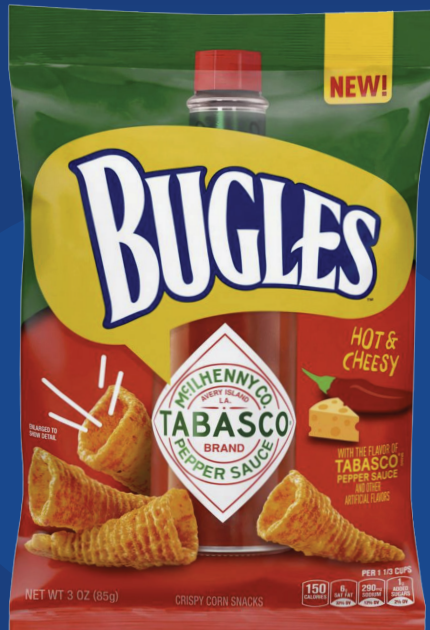
Bugles Tabasco 6 pk | 3 oz | GEM22563