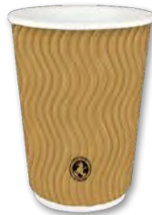
12 oz. S-Ripple Wall Hot Cup Item# BEI90569 Case: 500