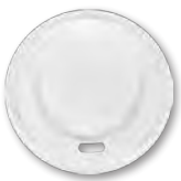
White Dome Lid Fits 8 oz. Item# AFK87739 Case: 1,000