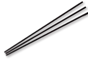
8" Black Stirrer Item# BEP1241207 Case: 10/500