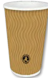
16 oz. S-Ripple Wall Hot Cup Item# BEI90570 Case: 500