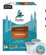
Caribou Coffee® Caribou Blend | 24ct. Vistar #: GMT37670