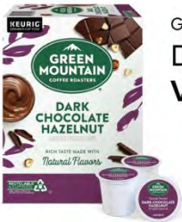
Green Mountain Coffee Roasters® Dark Chocolate Hazelnut | 24ct. Vistar #: GMT39140