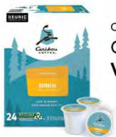
Caribou Coffee® Caramel Hideaway | 24ct. Vistar #: GMT36685

*Caribou Coffee is the first, largest, and only Coffee company in the US that is 100% Rainforest Alliance certified