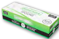
Wrapped Hvy. PS Boxed White Spoon Item# BEP90187 Case: 4/420