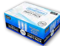
Wrapped Med-Hvy. PS Boxed White K(40) F(120) T(80) Item# BEP90189 Case: 4/240