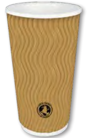
20 oz. S-Ripple Wall Hot Cup Item# BEI90571 Case: 500