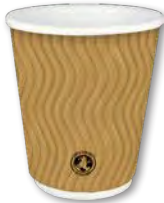
10 oz. S-Ripple Wall Hot Cup Item# BEI90568 Case: 500