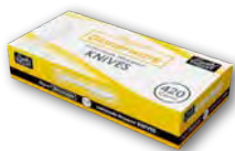
Wrapped Hvy. PS Boxed White Knife Item# BEP90183 Case: 4/420