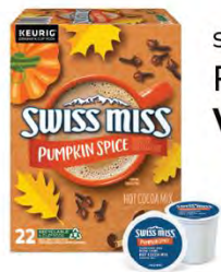
Swiss Miss® Pumpkin Spice Hot Cocoa | 22ct. Vistar #: GMT39979