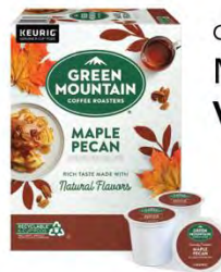
Green Mountain Coffee Roasters® Maple Pecan | 24ct. Vistar #: GMT37674