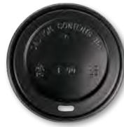
Black Dome Lid Fits 10 - 20 oz. Item# AFK88736 Case: 1,000