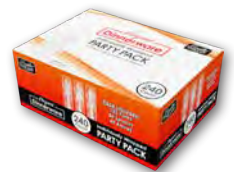
Wrapped Hvy. PS Boxed Clear K(40) F(120) T(80) Item# BEP90191 Case: 4/240