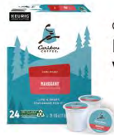
Caribou Coffee® Mahogany® | 24ct. Vistar #: GMT37673

Contact Your Sales Representative For More Information!