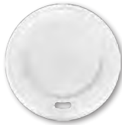
White Dome Lid Fits 10 - 20 oz. Item# AFK88737 Case: 1,000