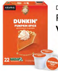
Dunkin'® Pumpkin Spice | 22ct. Vistar #: GMT01271