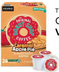
The Original Donut Shop® Caramel Apple Pie | 24ct. Vistar #: GMT38101