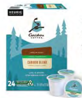
Caribou Coffee® Caribou Blend Decaf | 24ct. Vistar #: GMT37671