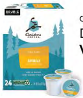
Caribou Coffee® Daybreak Blend | 24ct. Vistar #: GMT37669