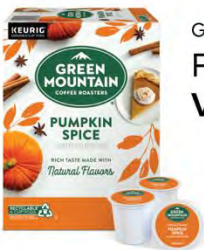
Green Mountain Coffee Roasters® Pumpkin Spice | 24ct. Vistar #: GMT06758

PRODUCTS AVAILABLE AFTER: JUNE 24, 2024*