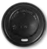
Black Dome Lid Fits 8 oz. Item# AFK87738 Case: 1,000