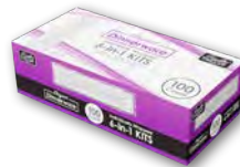
Wrapped Hvy. PS Boxed White Kit (K,F,T,12x13 NAP, S&P) Item# BEP90215 Case: 4/100