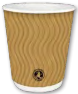
8 oz. S-Ripple Wall Hot Cup Item# BEI90567 Case: 500