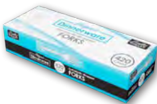
Wrapped Hvy. PS Boxed White Fork Item# BEP90185 Case: 4/420