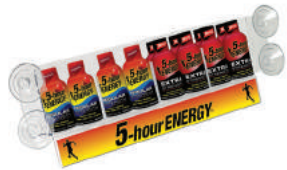
Free Acrylic Cooler Door Rack Item # R10004