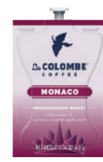
La Colombe® Monaco MDR00216