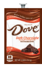
DOVE® Dark Hot Chocolate MDR00173