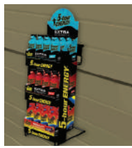
Free 3 Tier Ave. C Wall Display Rack Item # R3WALL