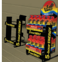
Free 2 Tier Ave. C Wall Display Rack Item # R2WALL