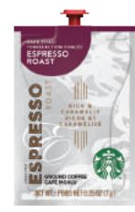
Starbucks® Dark Espresso MDR00218