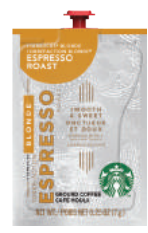
Starbucks® Blonde Espresso MDR00219