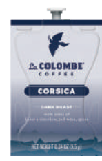
La Colombe® Corsica MDR00215