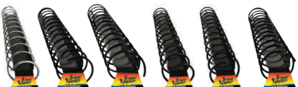
5-hour ENERGY® Rails AP Spiral Item # NI050 • AMS Right Spiral Item # NI080 AMS Left Spiral Item # NI090 • National Left Spiral Item # NI060 National Right Spiral Item # NI070 • USI Spiral Item # NI075